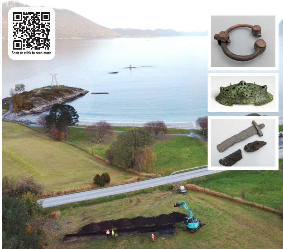
The image is from the archaeological excavation at Overåsanden. Among the finds were traces of agricultural activity dating back 5,000 years, as well as the remains of a longhouse that is over 1,000 years old.

Through lectures, written content, and visual storytelling from an archaeologist, Hod Heritage aims to create engaging and authentic encounters with the past. Academic knowledge is combined with narrative depth, offering both locals and visitors a meaningful connection to the history that surrounds them.