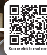
Scan or click to read more